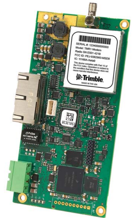
TMR1 Board Level, RJ45/Phoenix connectors