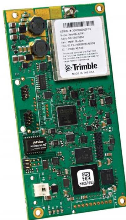
TMR1 Board Level, Data/LED/power headers